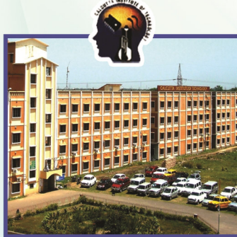
Calcutta Institute of Technology