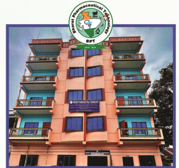
Bharat Pharmaceutical Technology